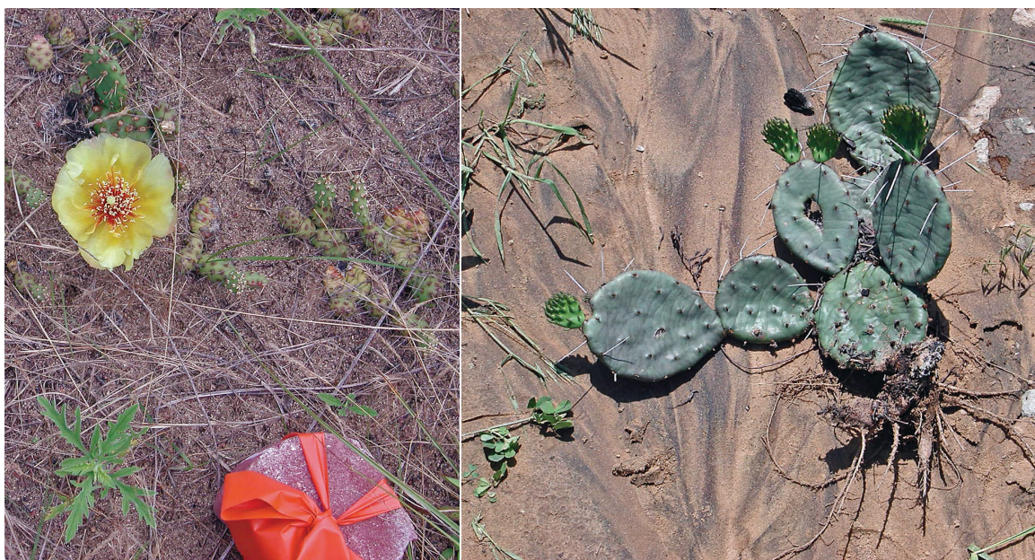
LEFT Opuntia fragilis in bloom near a tagged brick used to mark plants under study. The flowers have a green stigma, red stamen filaments, and yellow petals. RIGHT Opuntia humifusa , also found in Illinois, is shown here in western Indiana.

There are also important similarities between these populations. For instance, both sites har-