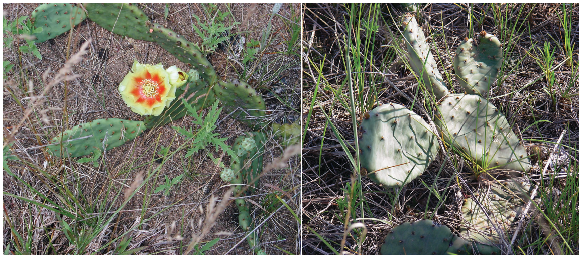
Opuntia macrorhiza in Lost Mound Site, Illinois.

We also observed a substantial number of flowers in the Illinois population—exciting news because O. fragilis flowers in Minnesota are rare.